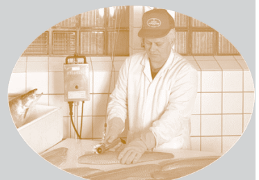
Pin bone removers since 1986

SHIPPING WEIGHT Net: 5 KG / Volume weight: 12 KG