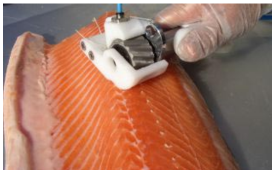
Gentle touch, least damage to fillet.