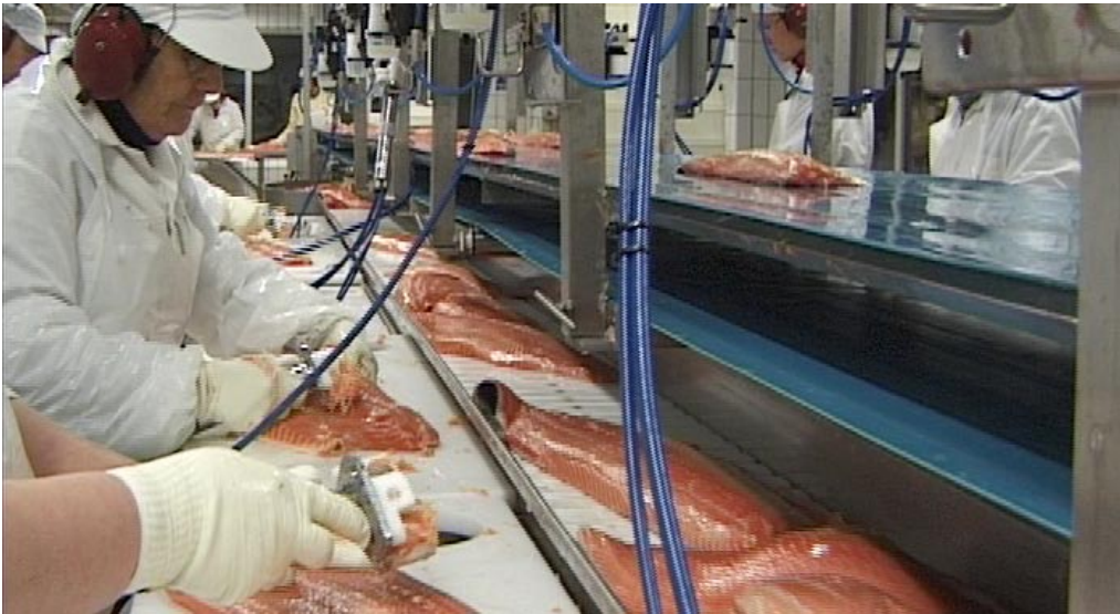
FTC Ergo-Light Pin Bone Remover is widely used for after control in processing line.

The FTC Ergo-Light Pin Bone Remover can be used for neck bones and pin bones left in the fillet after automatic pin boning. The FTC Ergo-Light Pin Bone Remover will have a higher productivity than pliers.